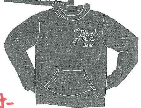
$10 Royal blue MS or HS names on the back